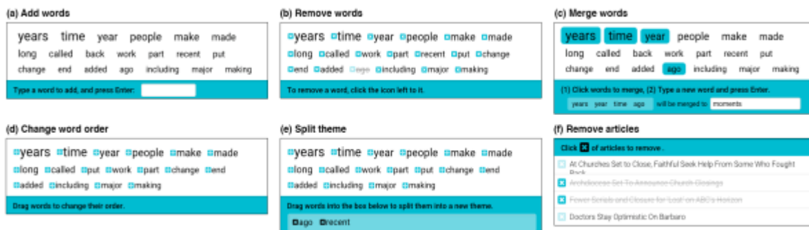
Figure 4. User interface implementation of the six refinement operations evaluated in the crowdsourced study, designed to support direct manipulation of topic words and documents. Participants had to first select an operation to view these tool details. Note that topics and documents were called “themes” and “articles” during the task.

Change word order was used in 76.7% of topics, with an average of 3.5 changes for each topic ( SD = 3.8 , Median = 2 ). Words were moved much more frequently to a higher probability position (81% of cases) than to a lower probability position. However, since participants focused on words near the top of the list (i.e., closer to rank 1), there was a significant negative correlation between the original word rank and the frequency with which a word’s order was changed (Spearman’s r_s = -.63, p < .003 ).